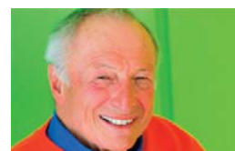
Richard Rogers